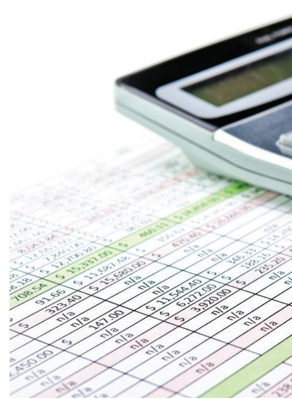
Touro Law Center Low Income Taxpayer Clinic

Settlement money you receive is likely taxable income and must be reported on your tax return. You should consider this before settling.